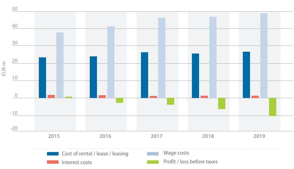
Figure 2: Residenz Gruppe financing costs and financial results since its acquisition by ORPEA